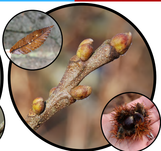
SWEET CHESTNUT Castanea sativa Green to red ovoid bud