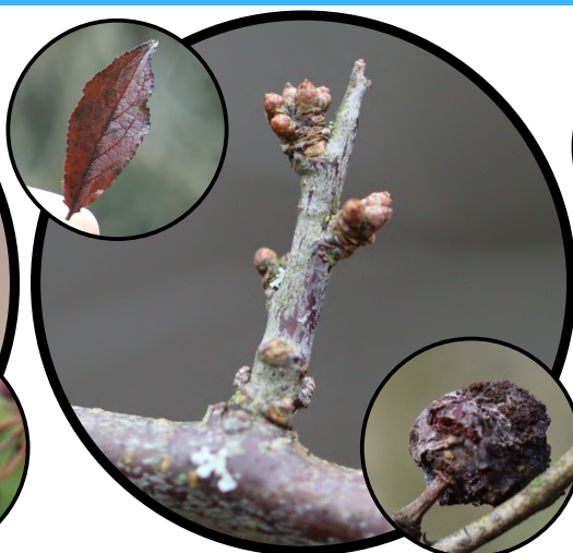
BLACKTHORN Prunus spinosa Tiny buds in clusters & thorns