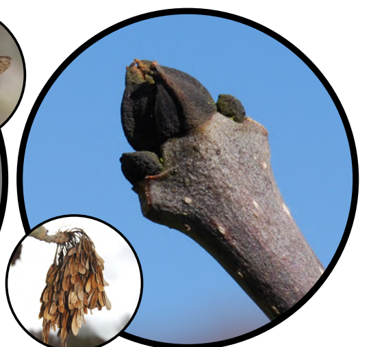
ASH Fraxinus excelsior Black bud, like a screwdriver tip