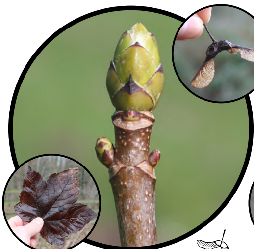
SYCAMORE Acer pseudoplatanus Large green bud