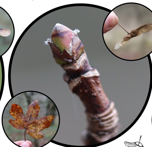
FIELD MAPLE Acer campestre Small green to red bud