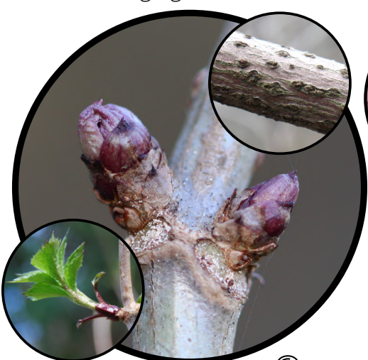
ELDER Sambucus nigra Purple, irregular-shaped buds