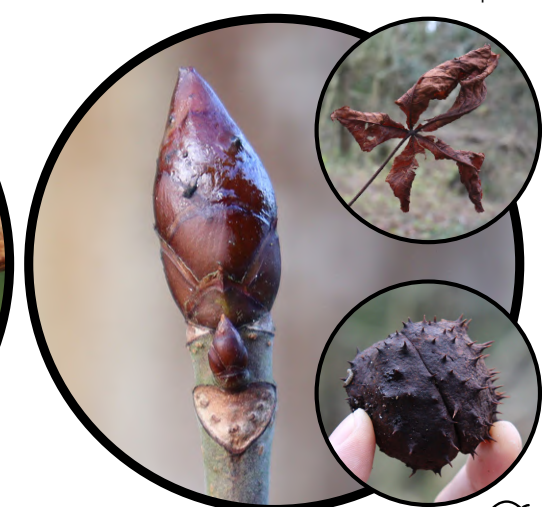
HORSE CHESTNUT Aesculus hippocastanum Large sticky bud & horseshoe mark