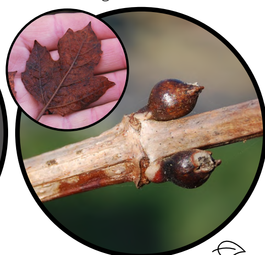
GUELDER ROSE Viburnum opulus Small brown tear-drop bud